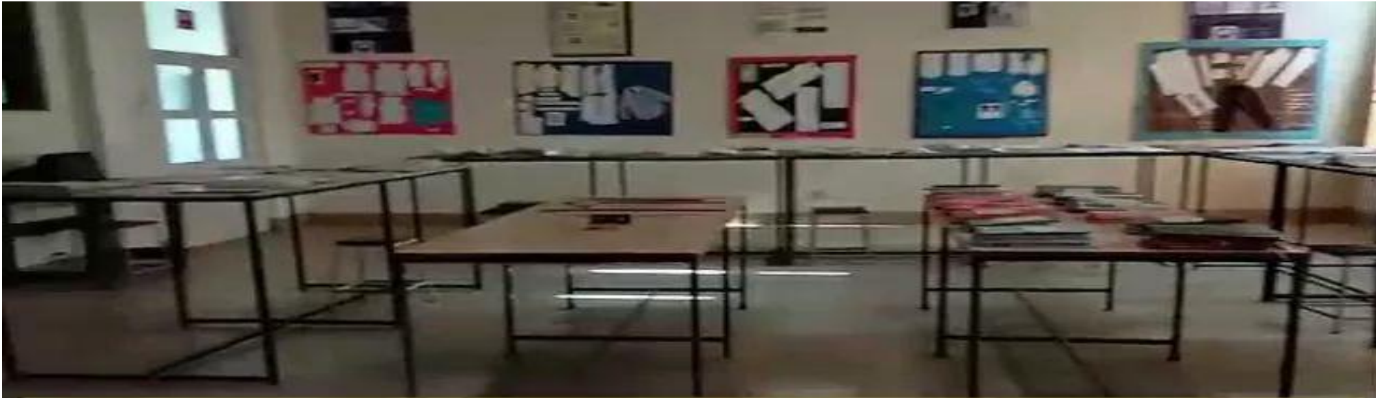
Department of Textile Engineering UET Lahore, Faisalabad campus